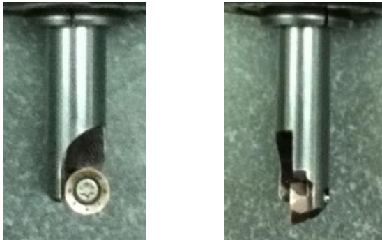
Figure 1 Assembly of ball-nose end mill and tool holder.

metal-cutting lubricant based on a composition of natural esters, which are formulated from renewable plant-based oils [1].