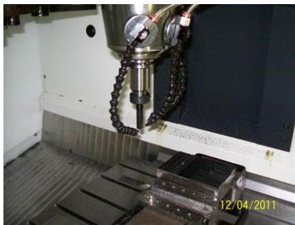
Figure 2 MQL experiment setup.

Response surface methodology was used to design experiments, model and optimize three response variables; namely, tool life, t_i , surface roughness, Ra, and resultant force, Fr. Each independent variable was coded at three levels between -1 and +1 in the matrix. The variables investigated were cutting speed, feed rate, axial depth of cut and width of cut, and varied in the range, as shown in Table 1.